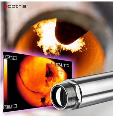
Xi 410 MT infrared imager measuring through flames inside a furnace